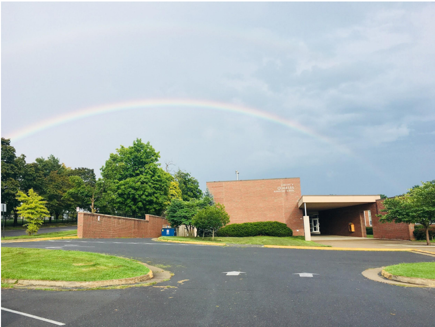
GQES: A Beautiful School!